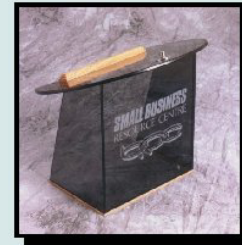
Table Top Podium

3 layers of glass actual size 2'6" by 3'6"